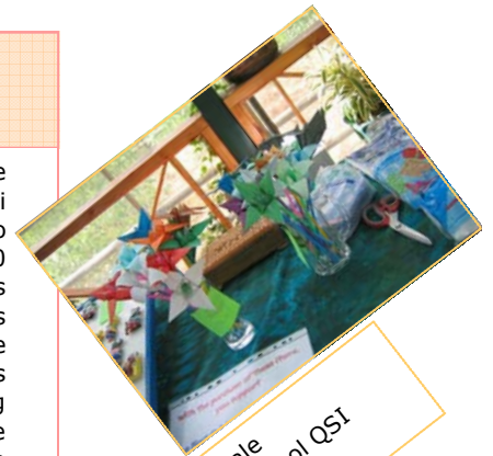
The Garage Sale International School QSI

sale of our decorative magnets and origami flowers we managed to raise a total of 3.400 denars. What makes us always remember this wonderful event is the terrific atmosphere as well as the outstanding collaboration with the QSI that we managed to establish.