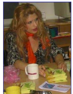
CDs for the youth included in the project ... autographed, of course!

computers, foreign language courses, specialized cookery training, reinforcing and encouraging them towards a life on their own, lobbying, representing and immediate psychosocial counseling. Within the framework of this