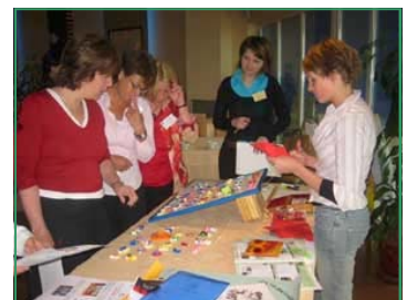
Great interest for our Embassy

much to tell about our accomplishments, the International women association promised us another more elaborate presentation of the Embassy, which is planned to take place after the summer holidays. Meanwhile, some of the members have already visited the Embassy and been our guests.