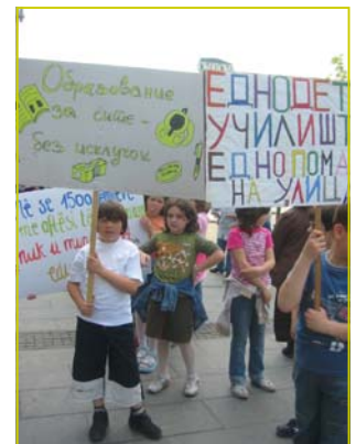
The march on the City Square

Delcev" - Stip, NGO "Doverba" - Kumanovo, PHURT - Delcevo, Children's Home - 11 th October - Skopje, Elementary School "Vasil Glavinov" - Veles, Elementary School "Blaze Koneski" - Veles, Elementary School "Sv. Kiril i Metodij" - Veles, El. S. "Blagoj Kirkov" - Veles, Elementary School "JJK - Dginot" - Veles, Elementary School "Stojan Burceviski - Butridan" - Veles,