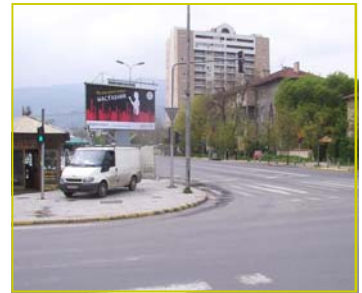
One of the ten billboards, donation from Accent Media