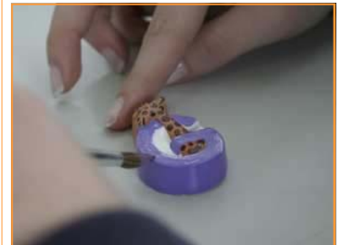
All figures/magnets are hand-made

Since each stage of the production process of the magnets is hand-made, everything is done very slow, but starting from September, the preparation will be included as a regular project in the program of the NOVA high school.