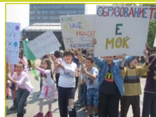
450 children and their teachers were marching on the City Square

taught lessons, marched streets, painted pictures, made posters, met officials, voted for teachers and added their voice to the campaign. " Among the celebrities which were involved in this campaign was he famous actress Angelina